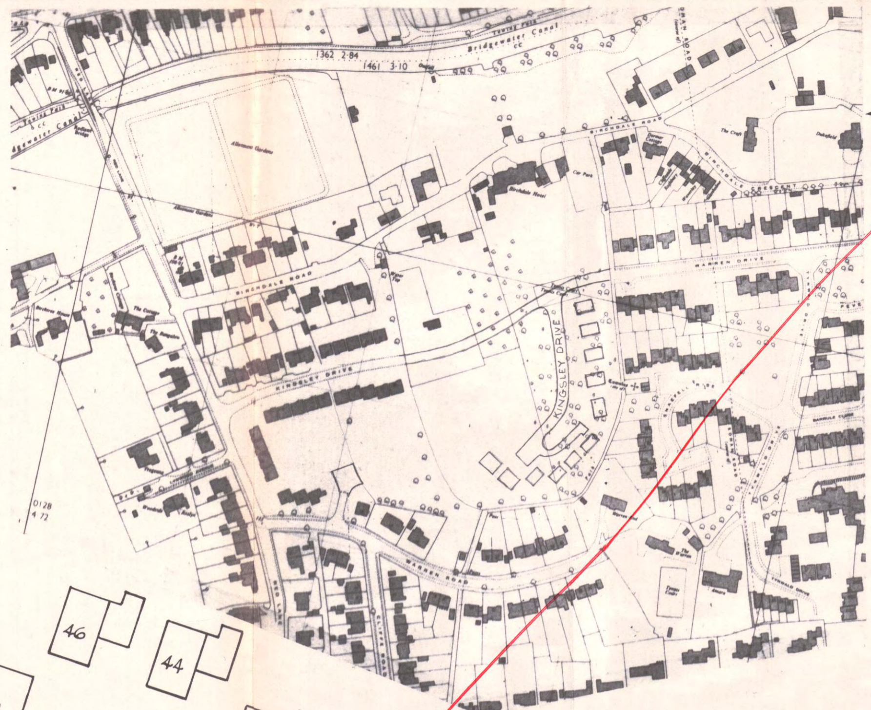
Location Plan. Scale 1:2500