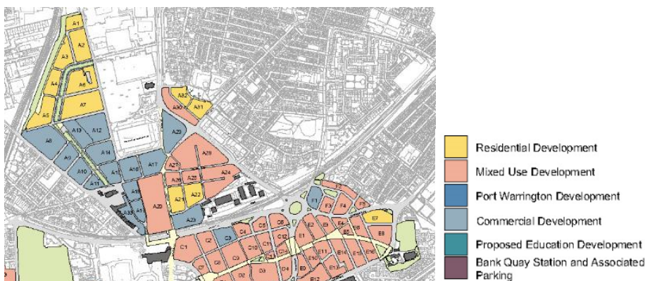
Figure 3 Extract from Overall Land Use Masterplan