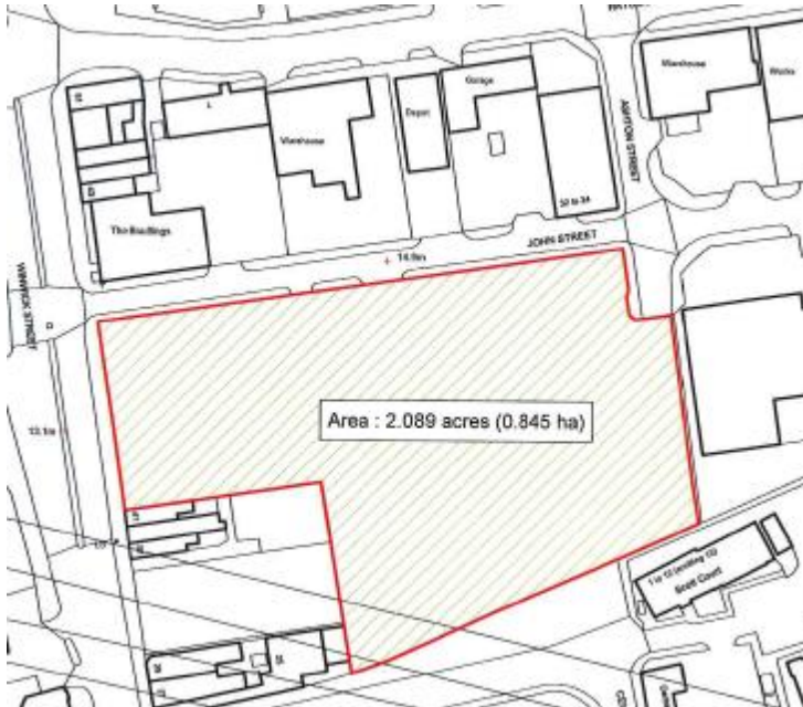
Figure 1 Site Location Plan: John Street, Warrington