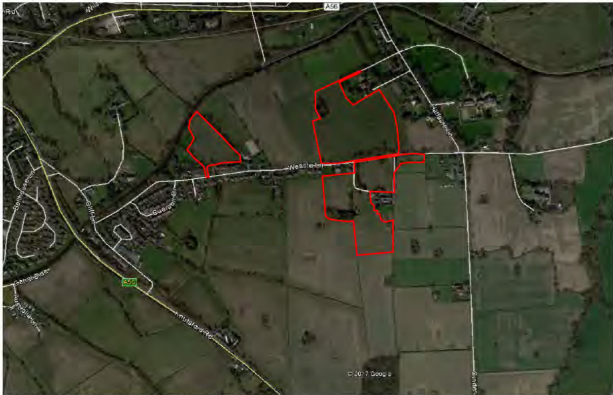
Figure 1: Site Location – Land to the north and south of Weaste Lane

These representations, [REDACTED] relate to land to the north and south of Weaste Lane, Warrington (within the proposed Warrington Garden City Suburb). The land the subject of these representations is illustrated in Figure 1 below, and falls within the parcel of land proposed as safeguarded land in the emerging Local Plan (Figure 2).