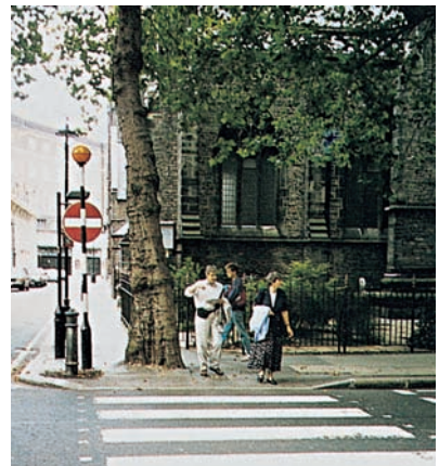
Street furniture and a well established tree obstructing the approach to a Zebra crossing.

4.5 As with refuges and signal-controlled crossings, it is important to keep the approaches to the Zebra crossing clear. Trees and street furniture are a hazard for pedestrians, especially those with disabilities.