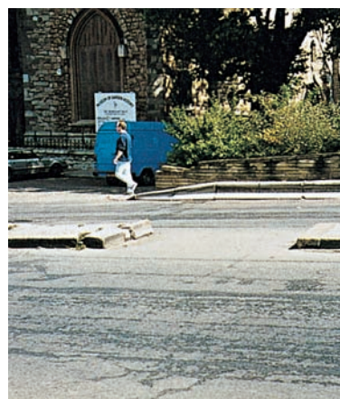
A clear conflict: a refuge intended for pedestrians but unsuitable kerbing opposite.

3.3 The carriageway width at the crossing should be sufficient to prevent vehicles passing too close to the refuge or the footway as this can be intimidating for pedestrians. Consider also the needs of cyclists who could be overtaken alongside a refuge. A single carriageway approach width of 4 to 4.5 metres adjacent to a refuge is recommended although refuges have been