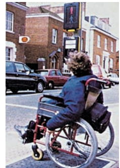
The push button should be readily accessible.

5.1.9 The push button unit should be close enough to the tactile surface to allow all pedestrians, who could reasonably be expected to use the crossing, to reach it easily. This is particularly important for crossings with kerb-side detectors.