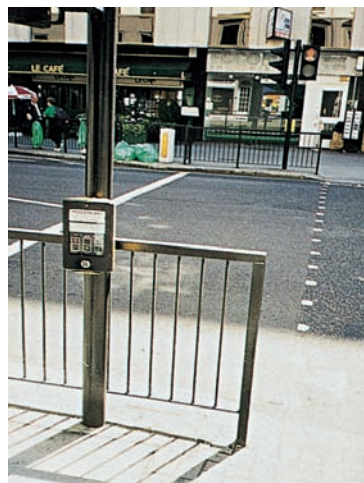
An example of bad site layout.

2.5.4 Guard railing, at signal controlled crossings, should start at the signal post but not encroach past the push button position.