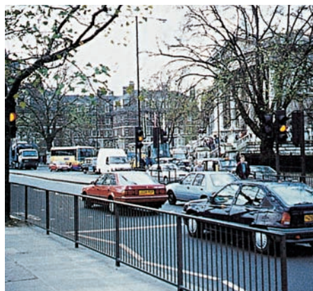
Left handed stagger installation.

5.2.5 Staggered crossings on two-way roads should have a left handed stagger so that pedestrians on the central refuge are guided to face the approaching traffic stream. At some crossings a right handed stagger may be unavoidable. Where this is the case, and there are far-side pedestrian signals, confusion can be caused if the pedestrian signals can be seen simultaneously. A waiting pedestrian may “see through” a red signal to a green signal at the opposite crossing. Careful alignment and special precautions to limit the field of view may be needed.