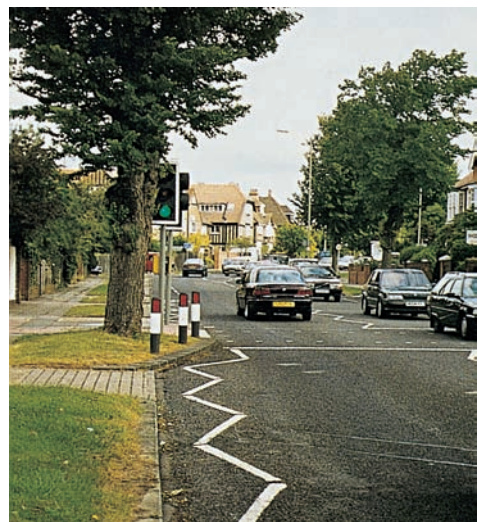
Built out kerb to improve the sight lines.