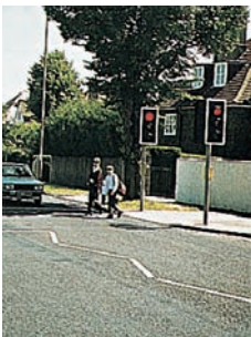
Additional signal heads may be employed at a signal-controlled crossing where this will improve driver awareness

2.3.2 Pedestrians must be able to see and be seen by approaching traffic. Visibility should not be obscured or restricted by, for example, parked vehicles, trees or street furniture. If it is not possible to site the crossing elsewhere consideration must be given to either removing/resiting the obstacle or, if the carriageway is sufficiently wide, to building out the kerb-line to provide enhanced sight lines. Particular care should be taken when drawing up the layout for a new crossing. For example, the controller should not be in a position that obstructs the intervisibility between pedestrians and approaching vehicles. The designer is responsible for anticipating not only the problems for maintenance but also the particular visibility problems for wheelchair users and children. If visibility is restricted by parked/loading vehicles, it may be necessary to make a Traffic Regulation Order or impose the maximum waiting and loading restrictions in the appropriate Crossing Regulations.