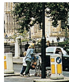
Good lighting will ensure clear visibility for approaching drivers. To enhance this, or if there is a problem with vertical alignment, a central marker beacon is sometimes used. Care should be taken that the beacon column does not obstruct pedestrians.