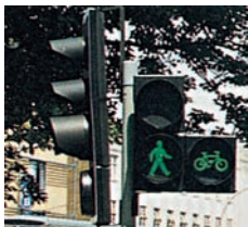
A near-side mounted signal may replace the far-side one for future Toucan crossings.

The red/amber period is fixed at 2 seconds.