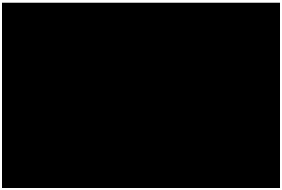
Visibility along the A56 looking east from a car positioned at the intersection of the junction

Residents vehicles and heavy farm traffic have to pull well into the carriageway before exiting the junction. The proposed changes would not improve this situation. In fact the danger of accidents is increased with the additional volume of traffic and also taking into account vehicles exceeding the speed limit.