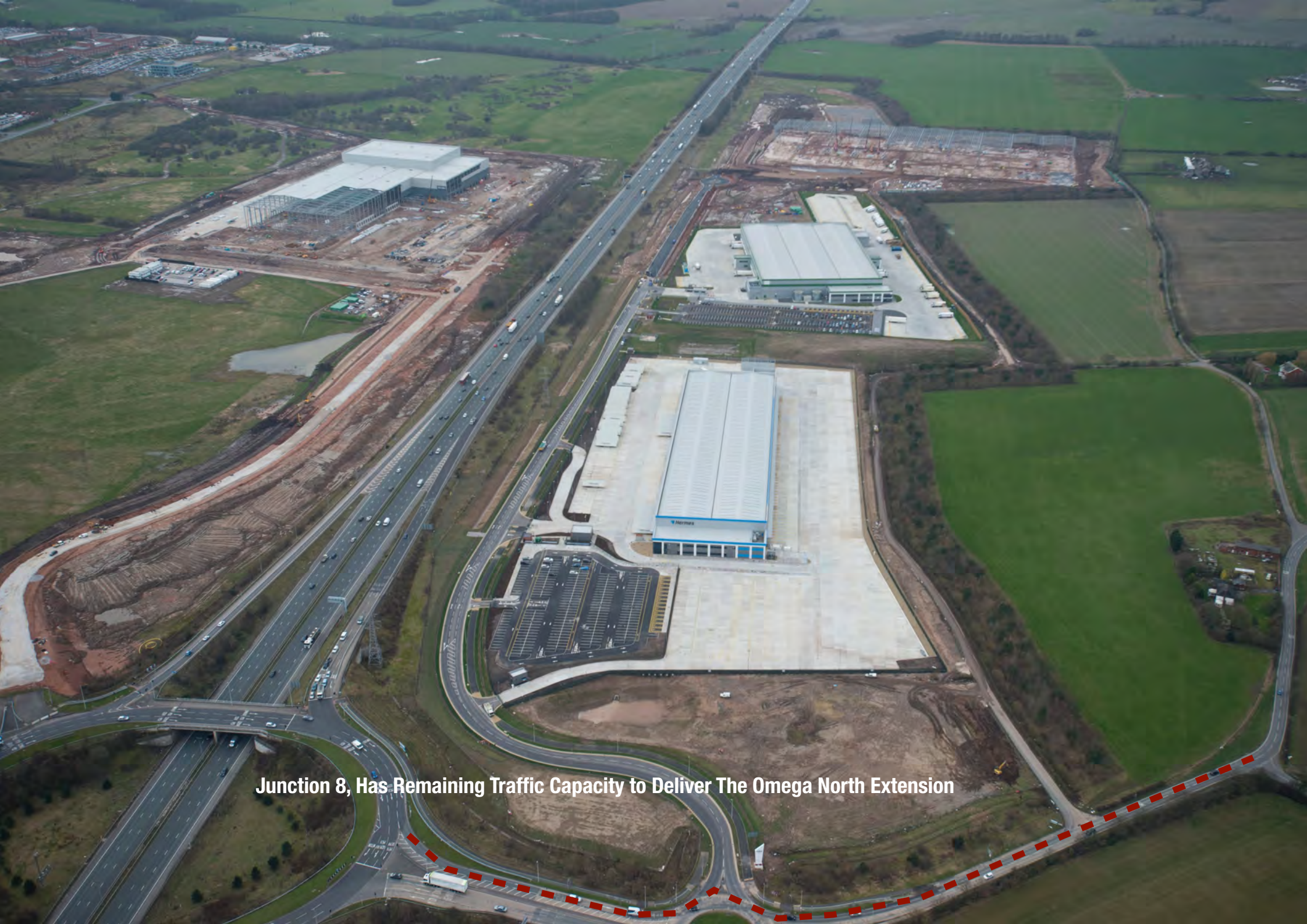
Junction 8, Has Remaining Traffic Capacity to Deliver The Omega North Extension