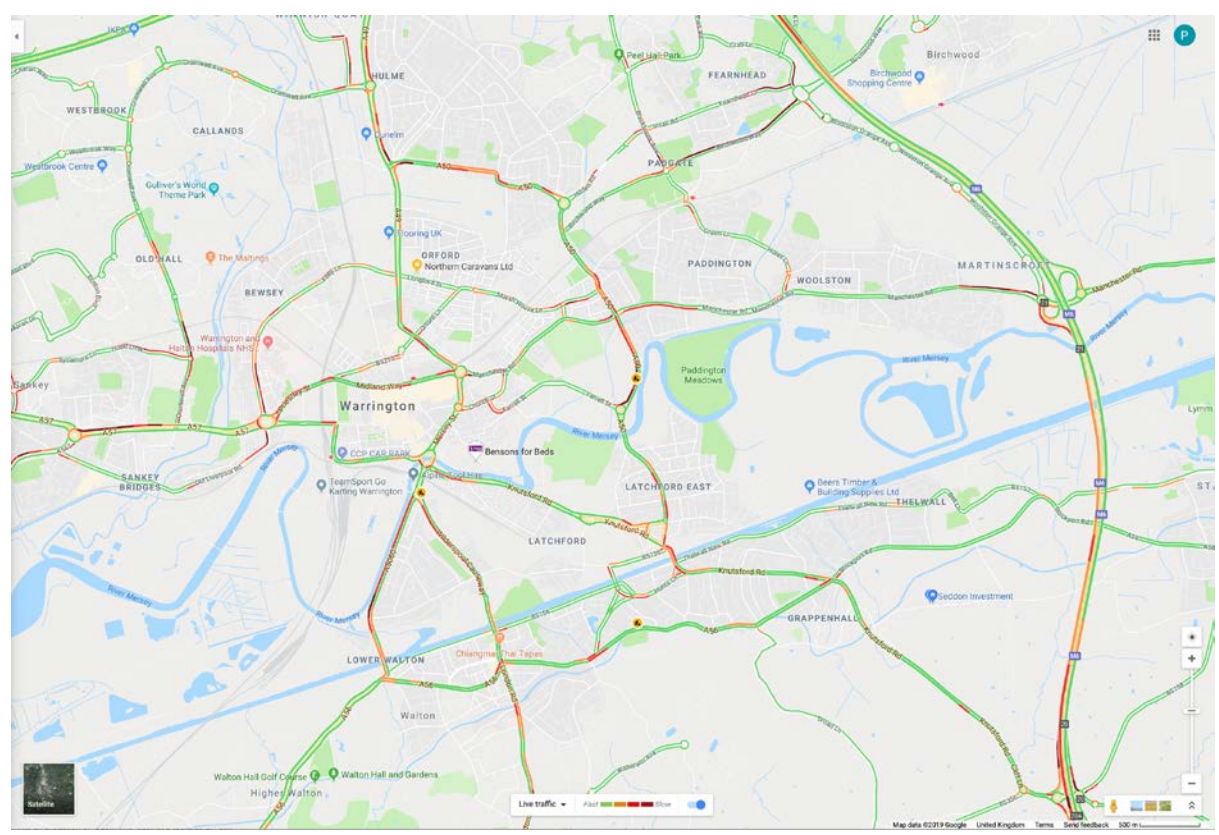
Typical daily traffic congestion on the Warrington Area road network