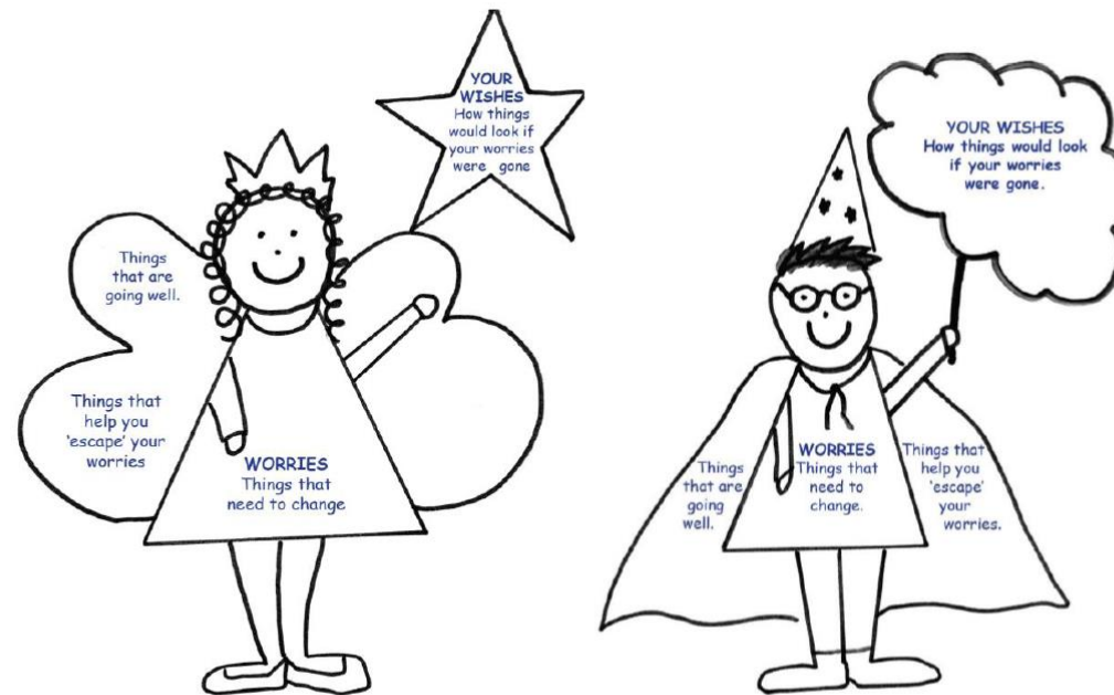
The Wizard and Fairy Tool:

The Fairy/Wizard tool serves the same purpose as the Three Houses Tool, but with different pictorial representation. Rather than Three Houses, you can explore the same three questions, using a drawing of a fairy with a magic wand or a Wizard figure. The same process for using the three houses tool applies in using the Wizard/Fairy tool. The practitioner can present the child with a pre-drawn outline or begin with a blank page and draw the wizard or fairy from scratch, asking the child to help, depending on what best suits the situation.