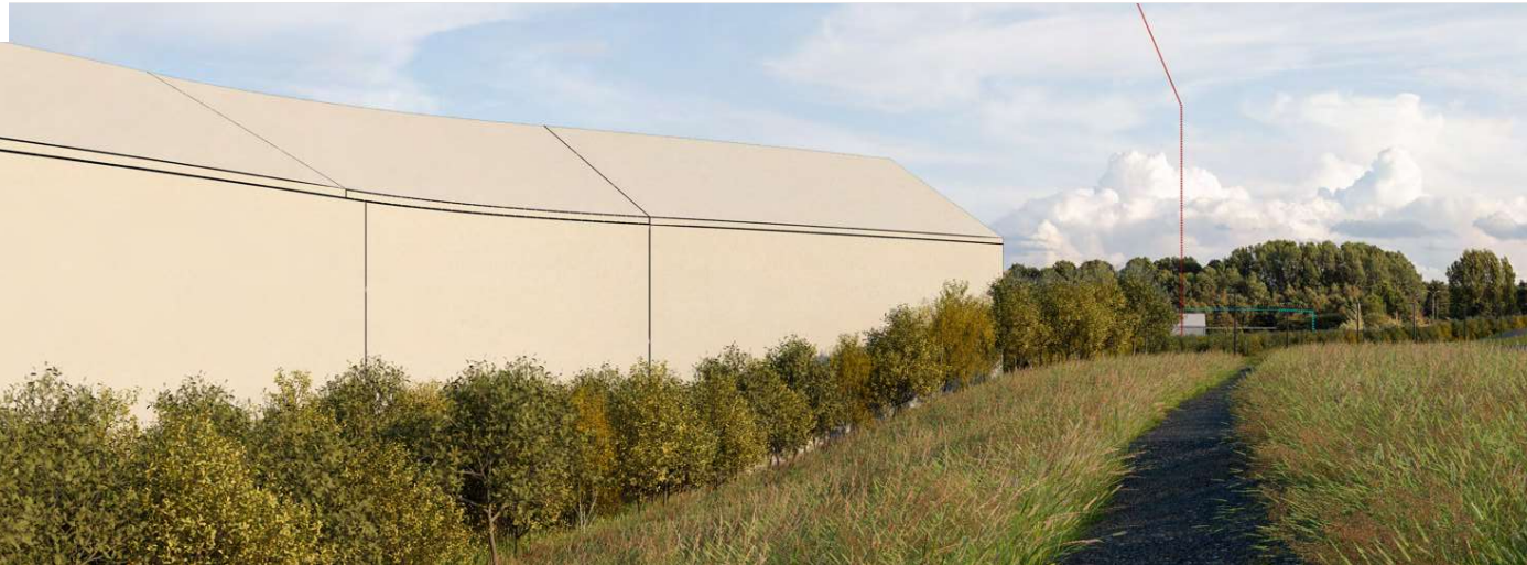
Photoviewpoint 04 - Proposed View (Year 15 + Parameters)