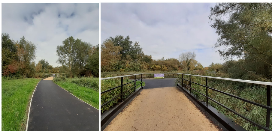
Figure 5: Images of some of the Saxon Park related works